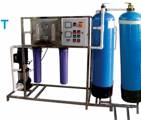
RO PLANT 500LPH