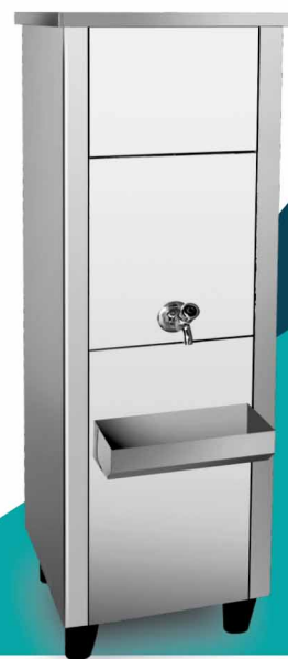
SS2020 RO Capacity:25Ltrs. WATER COOLER WITH RO