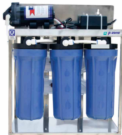
25 LPH RO plant