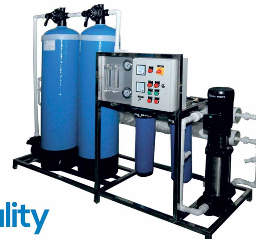
RO PLANT 1000LPH