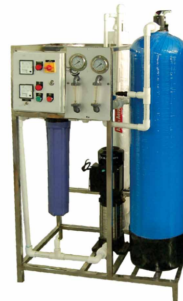
RO PLANT 250LPH